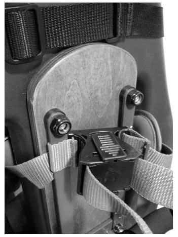
STEP 6 REATTACH THE NUT ON LEFT VERTICAL BAR.