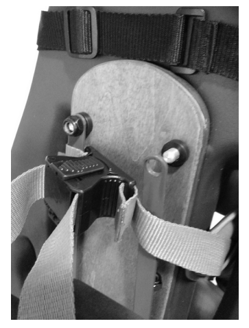
STEP 7 UNSCREW ONLY THE NUT ON RIGHT VERTICAL BAR.