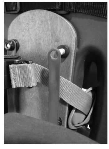
STEP 8 THREAD RIGHT CHEST STRAP BEHIND THE BAR, BETWEEN BAR AND SEAT.