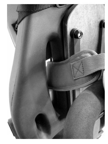
STEP 2 THREAD LEFT STRAP THROUGH LEFT SHOULDER SLOT ON BACK OF SEAT.