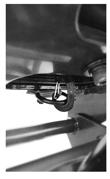
STEP 3 TILT SEAT FULLY FORWARD TO CLIP CROTCH STRAP CLIP ONTO D-RING ANCHOR.