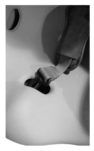
STEP 1 THREAD CROTCH STRAP DOWN THROUGH CENTER CUSHION SLOT.