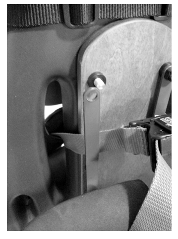
STEP 4 THREAD LEFT CHEST STRAP BEHIND THE BAR, BETWEEN BAR AND SEAT.