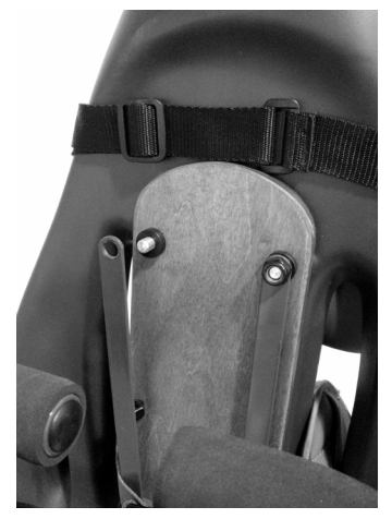
STEP 3 UNSCREW ONLY THE NUT ON LEFT VERTICAL BAR.