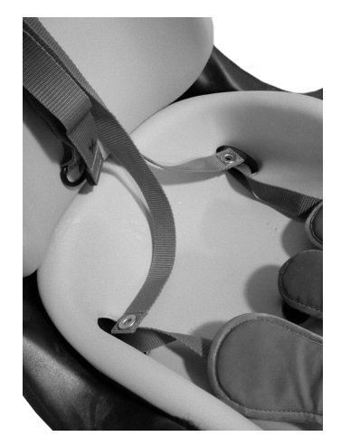
STEP 11 THREAD LEFT AND RIGHT CHEST STRAPS DOWN THROUGH THE SEAT CUSHION SLOTS.