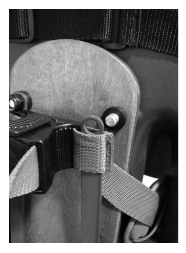
STEP 9 SLIDE THE RIGHT MOUNTING LOOP OVER THE VERTICAL BAR.