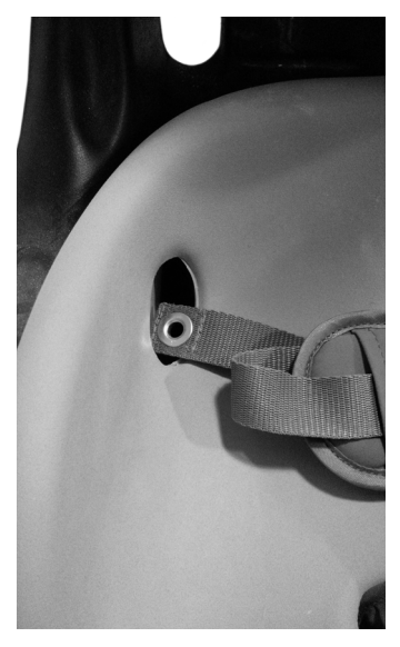
STEP 4 THREAD RIGHT WAIST STRAP DOWN THROUGH RIGHT SLOT.