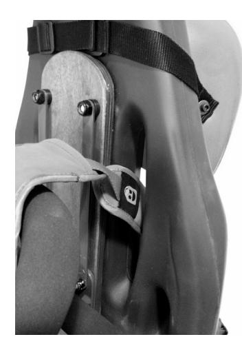
STEP 1 THREAD RIGHT STRAP WITH LOGO THROUGH RIGHT SHOULDER SLOT ON BACK OF SEAT.