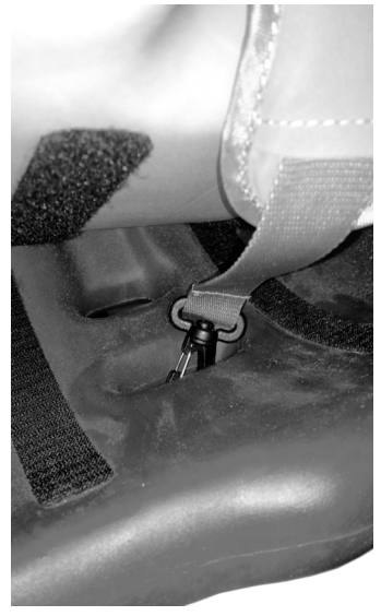
STEP 2 THREAD CROTCH STRAP DOWN THROUGH SEAT SLOT.