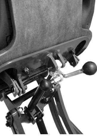
STEP 12 INSTALL LEFT AND RIGHT STRAPS INTO THEIR CORRESPONDING ANCHOR BOLTS IN THE PROPER STRAP ORDER (SEE STEP 6 ON PREV. PAGE FOR DETAILS).